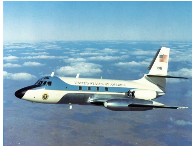
Lockheed C-140 Jet Star